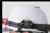
Mounted to helmet band * Attached to belt clip