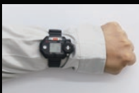
Attached to wrist (wristwatch type) *Attached to watch band