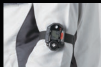
Worn on arm (band type) * Attached to arm band